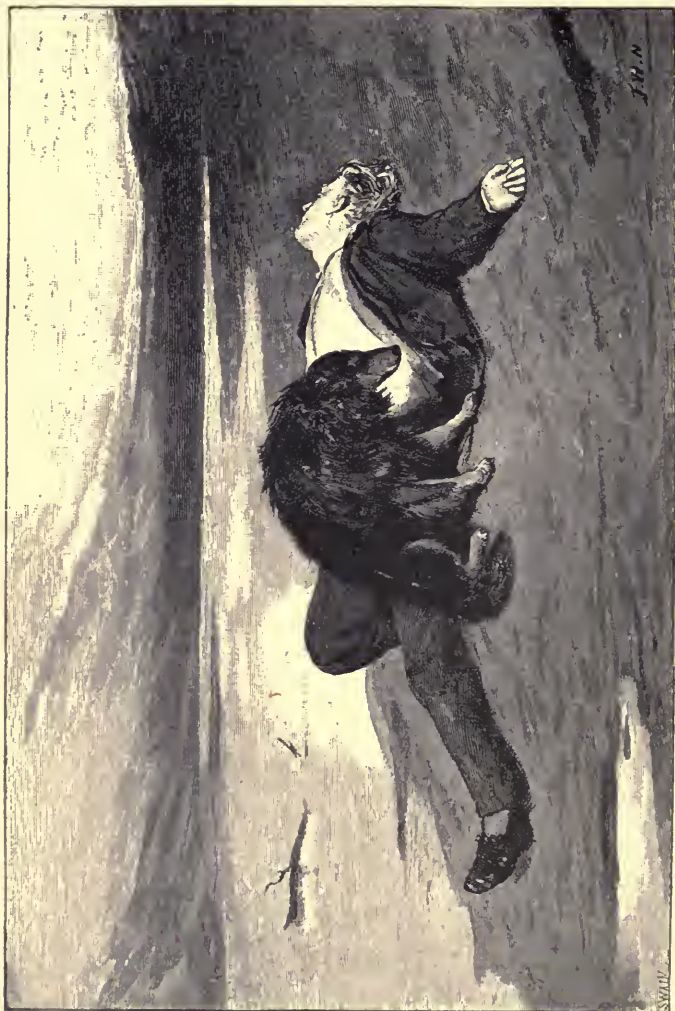
HE WHO HAD FOUGHT THROUGH THE LONG NIGHT NOW SANK HOPELESS AND HELPLESS. — Page 251.